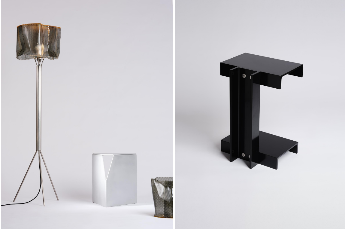
Left to right: ISSA floor lamp; Satellite stool; ISSA vase; U table by LS GOMMA