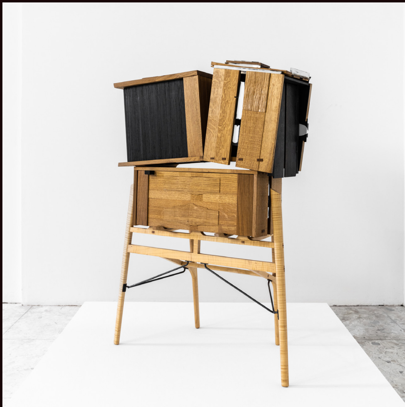
Littoral Chances I. 2017. European Oak, bog Oak, Bird's Eye Maple, Ripple Sycamore, Cedar of Lebanon, Douglas Fir, vitreous enamel on mild steel panels, steel. 110cm x 76cm x 37cm. £17,000.