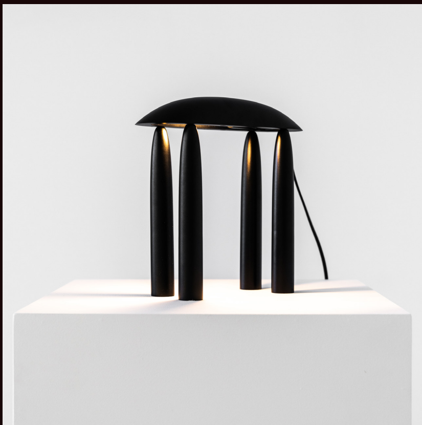
Oblago. 2021. Anodised aluminium. Edition of 20. 8cm x 25.5cm x 25cm. £900 + VAT.

Basel-based designer and architect Raphael Kadid's minimal lighting solutions are contemporary artefacts that re-examine the boundaries of lamps as household objects. Through research of primitive architecture, neo-futurism and machining capabilities, Raphael assembles industrial and refined metal forms that are balanced and composed. Miniature obelisks are stacked, balanced and seemingly massive whilst highly polished single-piece CNC pendants are reflective and inviting space-age vessels shedding soft, warm light. With considered anodised and polished finishes, his sculptural entities are both familiar and beautifully strange at once.