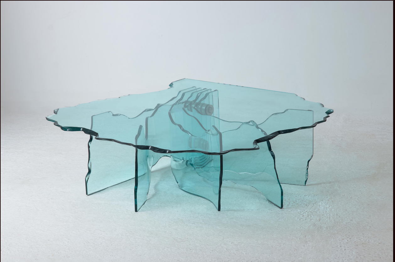
Shell coffee table. 1988. Manufactured by Fiam Italia. Glass, stainless steel. 125cm x 122cm x 40cm. £4000 + VAT.

American-born, London-based Danny Lane makes distinctive sculptures and design objects exploring the properties of glass, steel, wood and stone ranging from domestic furnishings to monumental public works. Since establishing his first studio in London's East End in 1981, Danny has experimented with juxtapositions of materiality through means of process and assemblage. Expanding on traditional approaches to glass and metal smithing, organic cut glass forms sit alongside deliberate forged steel support and natural timber accents creating distinctive objects of delicate ornateness born from an industrial heritage.