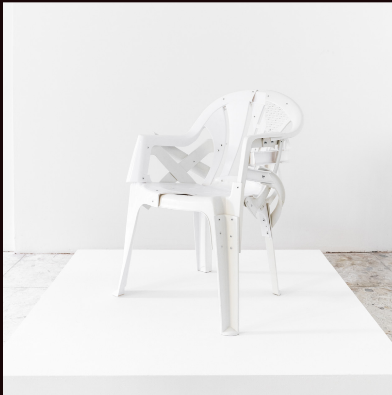
Copytopia Chair. 2020. Polypropelene, aluminium, RVS. 80cm x 59cm x 61cm. £1860 + VAT.