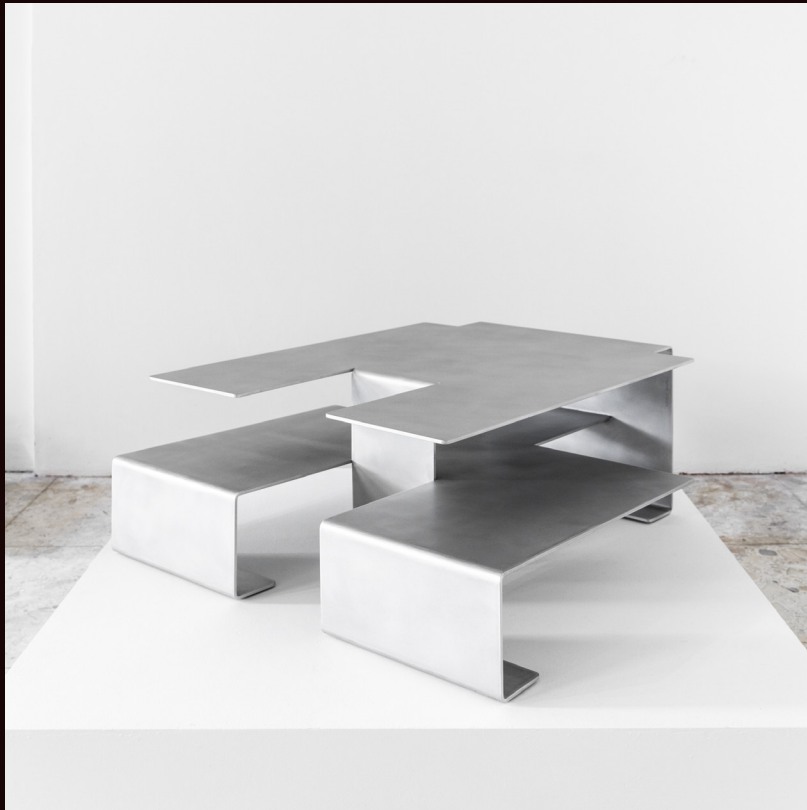
Staple table. 2022. Aluminium. Edition of 25 + 2APs 90cm x 90cm x 35cm. £3,170 + VAT.

Paris-based designer Wendy Andreu allows an experimental view towards materiality guide her practice. Concept and context drive Wendy's hands-on approach to the construction of her objects as she reimagines processes in metalworking and textile application to transform materials into talkative outcomes that reframe ergonomic expectations. Trained as a metalworker, Wendy looks beyond traditional processes, embracing unconventional and unabashed experimentation to grasp the tactile potential of materials and find surprising outcomes that can refine and translate into functional design outcomes.