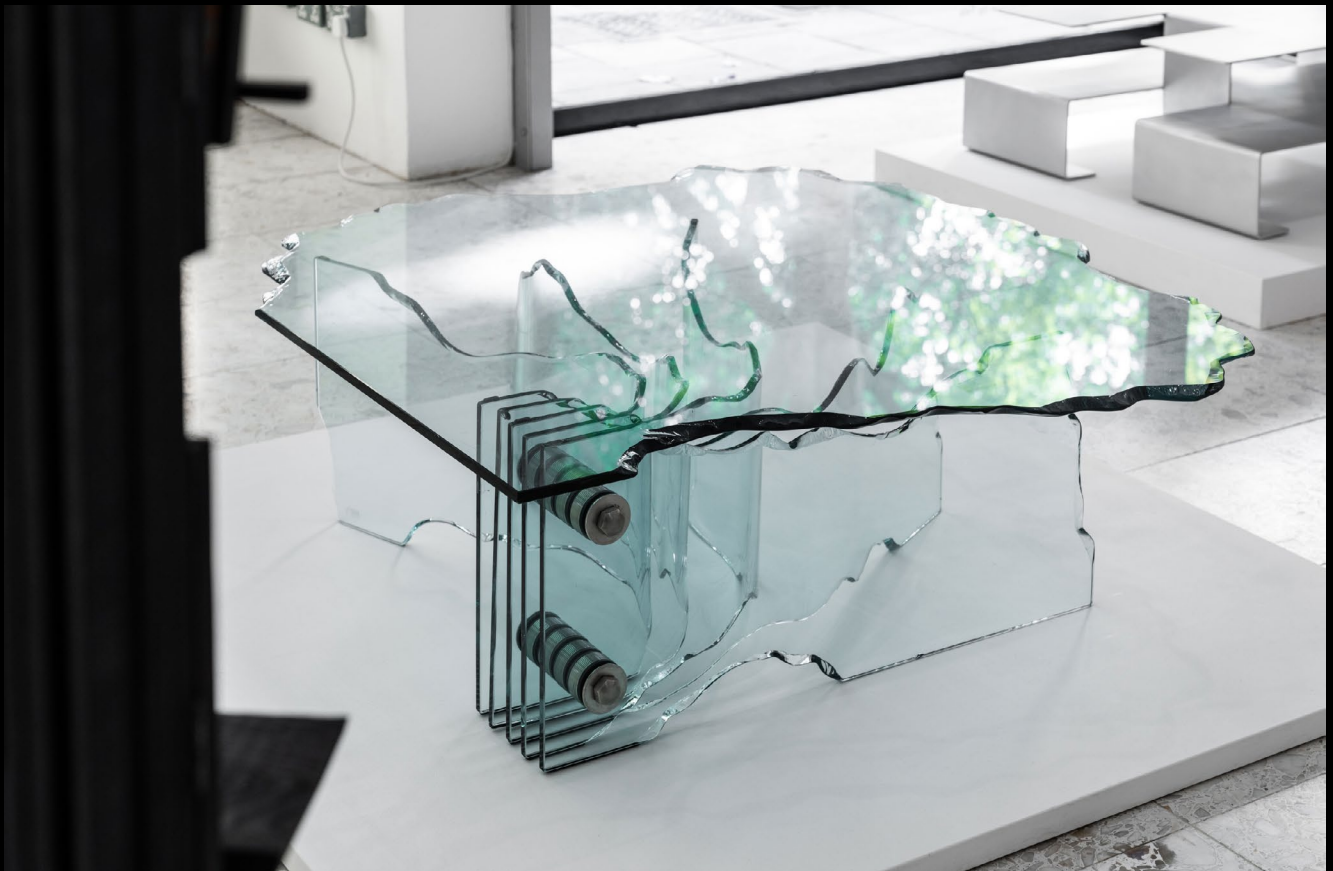
All photos here .