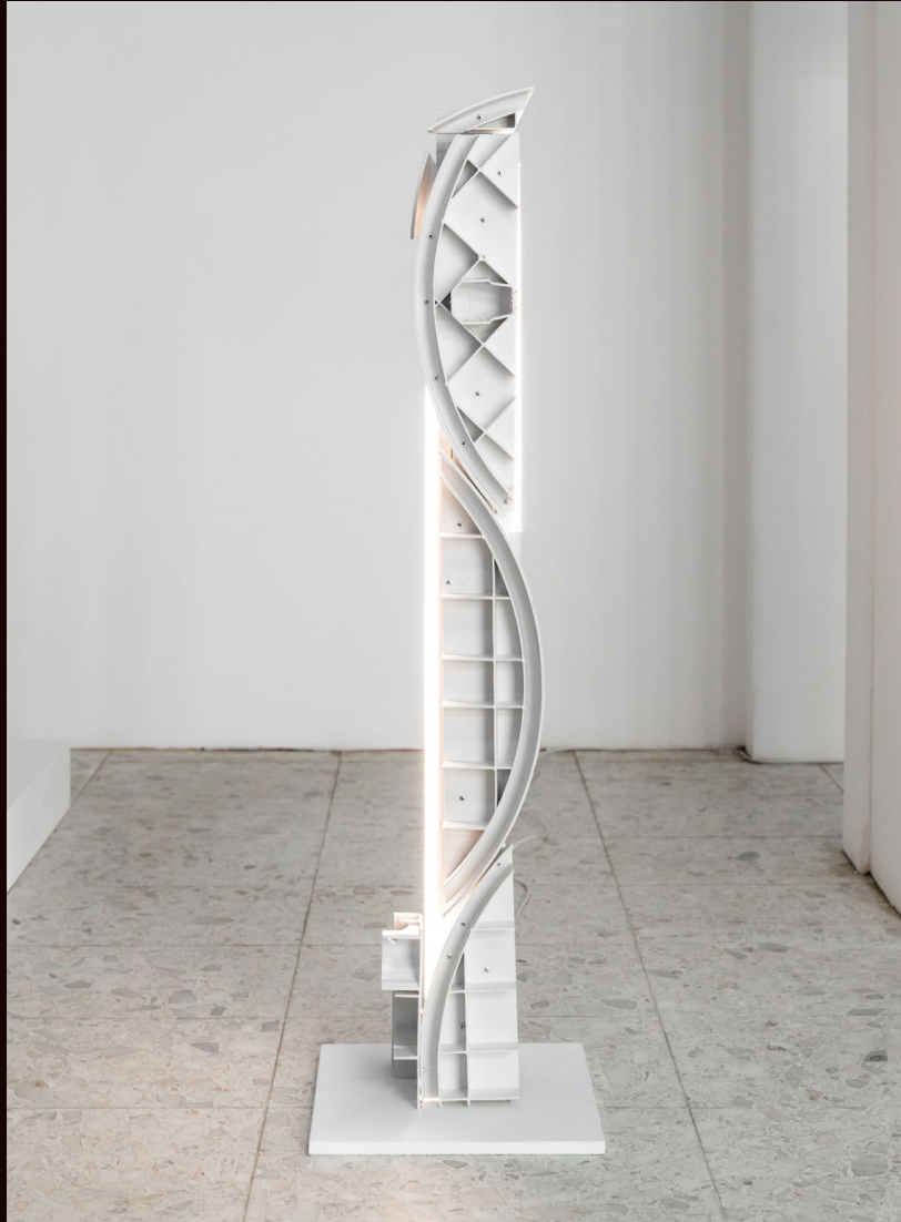
Inside-Out tower lamp Polypropylene, aluminium, RVS, electric components 146cm x 20cm x 20cm £1900 + VAT