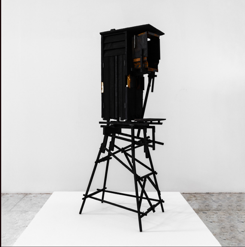
GYC#2. 2018. Scorched and pigmented Elm and Ash, Bird's Eye Maple, Cedar of Lebanon, vitreous enamel on steel panels. 134.5cm x 59.5cm x 42cm. £15,000 + VAT.