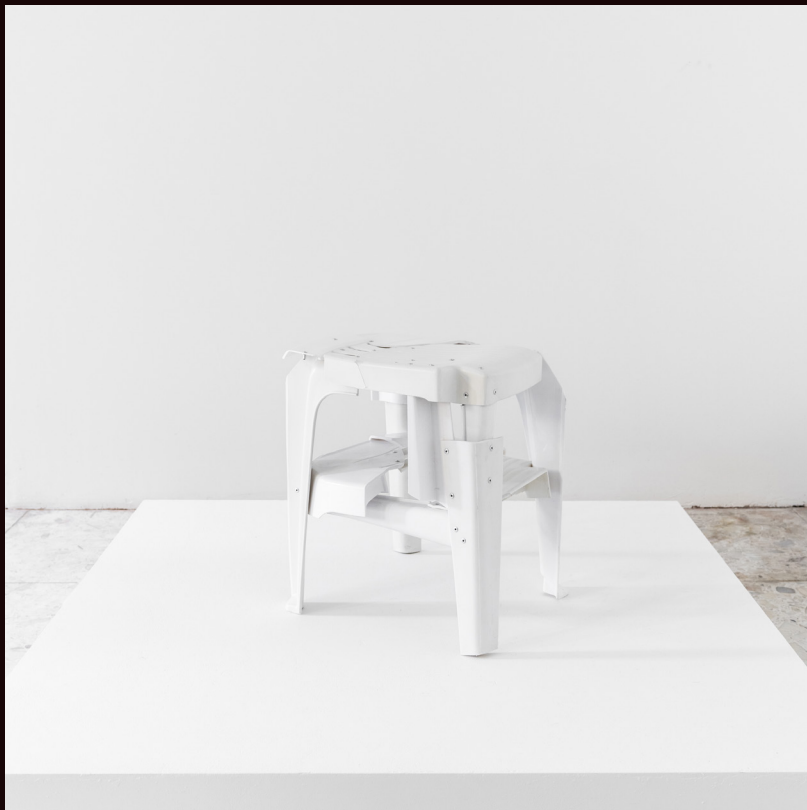
Stool. Polypropelene, aluminium, RVS, steel. 45cm x 40cm x 40cm £950 + VAT.