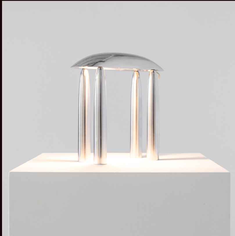
Oblago. 2021. High polished aluminium. Edition of 10. 8cm x 25.5cm x 25cm. £900 + VAT.