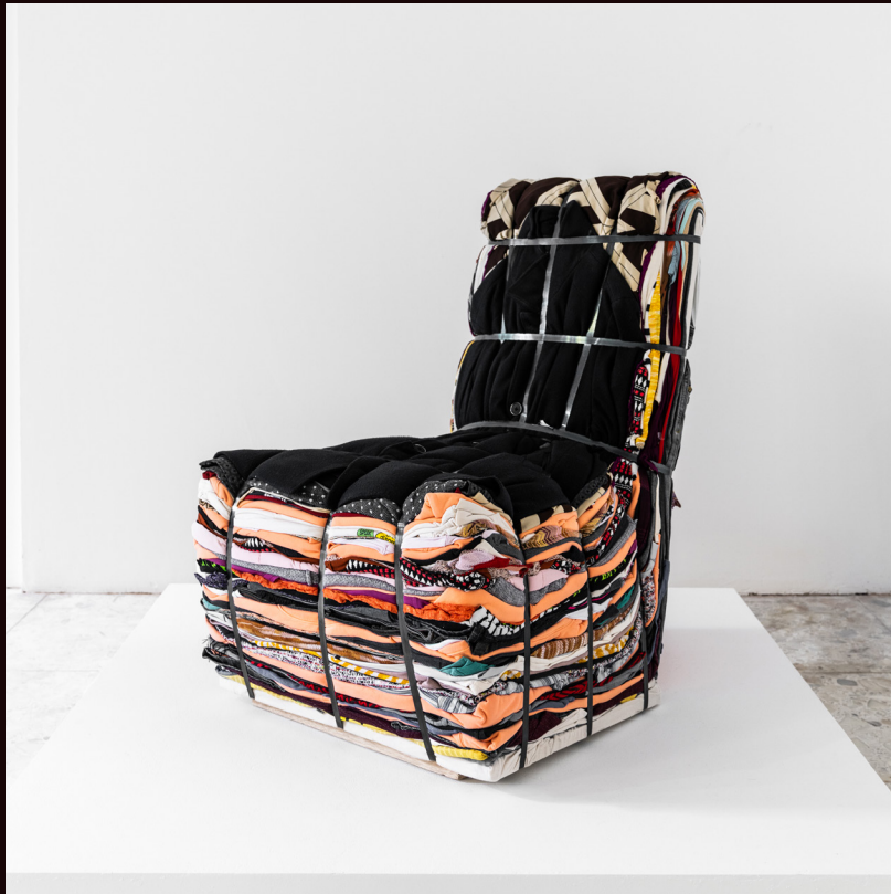
Rag Chair. 2022. Textiles, MDF, straps. 55cm x 80cm x 90cm. £4,000 + VAT.

Dutch designer Tejo Remy reinvents, reclaims and recontextualises obsolete materials and found objects to create playful and critical sustainable design pieces. A cohort of design collective Droog from its conception in the 90s, Tejo laid the foundations for the next generation of designers exploring everyday objects and waste as a potential material to build upon. Binds, straps and ratchets are often the means of support for his intuitive and carefully engineered structures, allowing the works to wear their materials; whether it's old rags, tennis balls or drawers, each unique assemblage is proudly obvious in its construction and celebrates the familiar in novel and contemporary contexts.