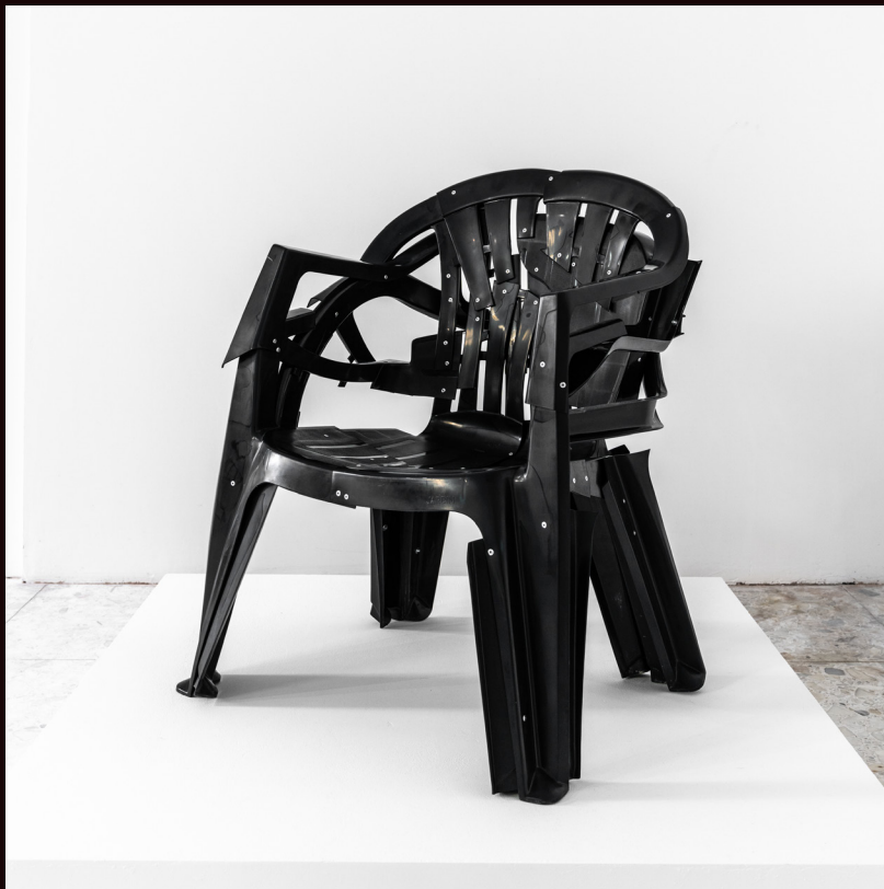
Times Four Armchair. Polypropelene, aluminium, RVS. 87cm x 70cm x 56cm £2,500 + VAT.

Redefining the paradigm between creation and consumption, Amsterdam-based designer Pierre Castignola makes familiar furniture which explores the ambiguous middle grounds between patent law and the freedom to create and the hypocrisy and irony that coincide. Reassembling one of the most recognisable objects - the plastic garden chair - his functionally surrealist creations recontextualise one of the most industrially mass produced objects into surprising and intuitive structural collages. Although Pierre's legacy objects take on new forms and functions, their ubiquitously familiar aesthetic and material qualities serve as an eerily consistent reminder to their original heritage.