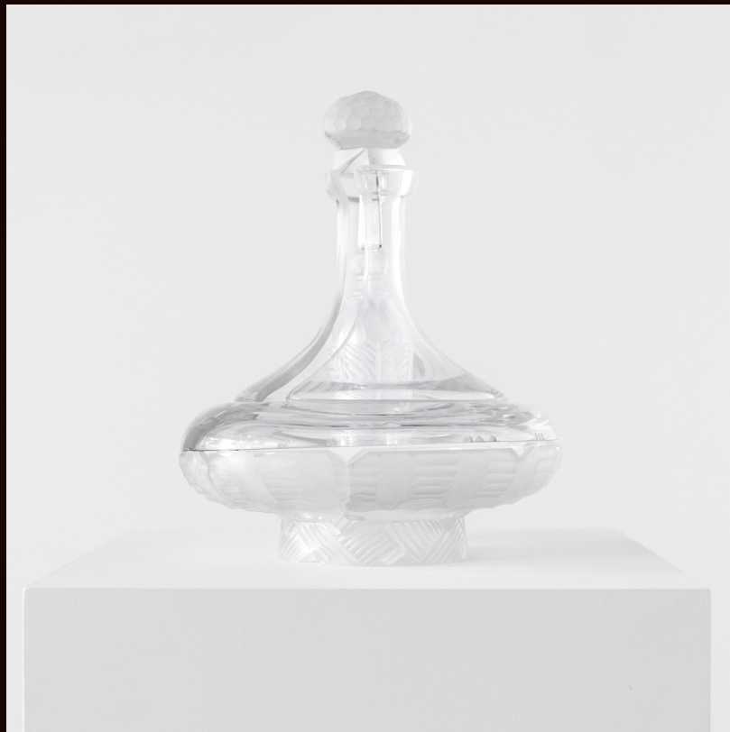
Waterford Crystal Lantern. 2015/ 2022. Salvaged crystal glass. 35cm x 17cm x 17 cm. £12,400 + VAT.

Edinburgh-based glass artist Juli Bolaños-Durman's work is driven by giving new life and second chances to surplus glass destined for refuse. With waste material the starting point, she turns found and discarded objects into detailed designs and sculptures of ornate decoration, vivid colour and delicate assemblage. Inspired by the luscious tropical surroundings of a childhood in Costa Rica, Juli uses a variety of cold working processes to embellish and elevate surplus crystal glassware; cutting, arranging, mixing textures, forms and colours into unique objects that embody the joy of their own process.